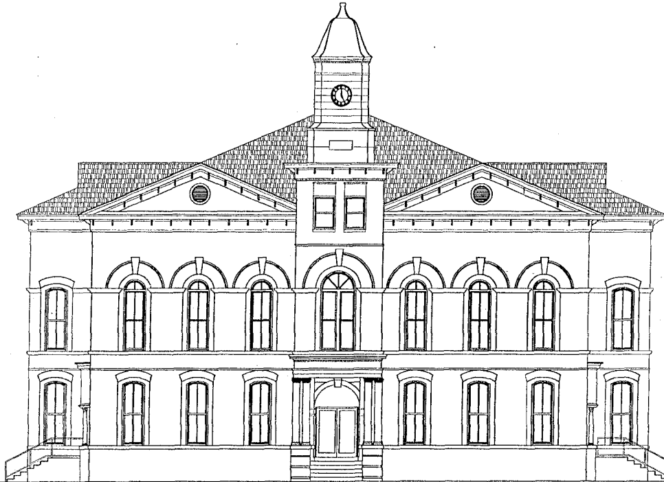
PIKE COUNTY COURTHOUSE ADDITION - SLOPED ROOF OPTION